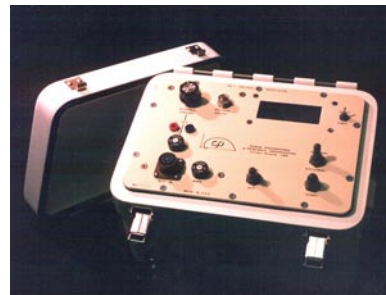
2 Zonge VR-1B Voltage Regulator included with all Motor/Generators

Specifications subject to change without notice 200304 © Copyright 2003, Zonge Engineering & Research Organization, Inc.